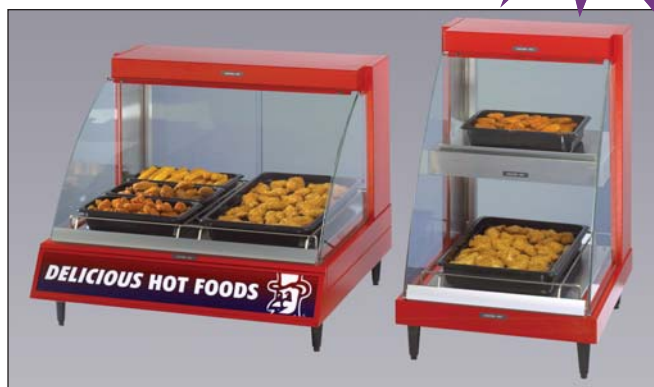
Left: GRCD-2P featuring optional red designer color, optional backlit base holder, and optional vinyl graphic transparency insert. Right: GRCD-1PD with optional red designer color.

* optional features are not retrofittable