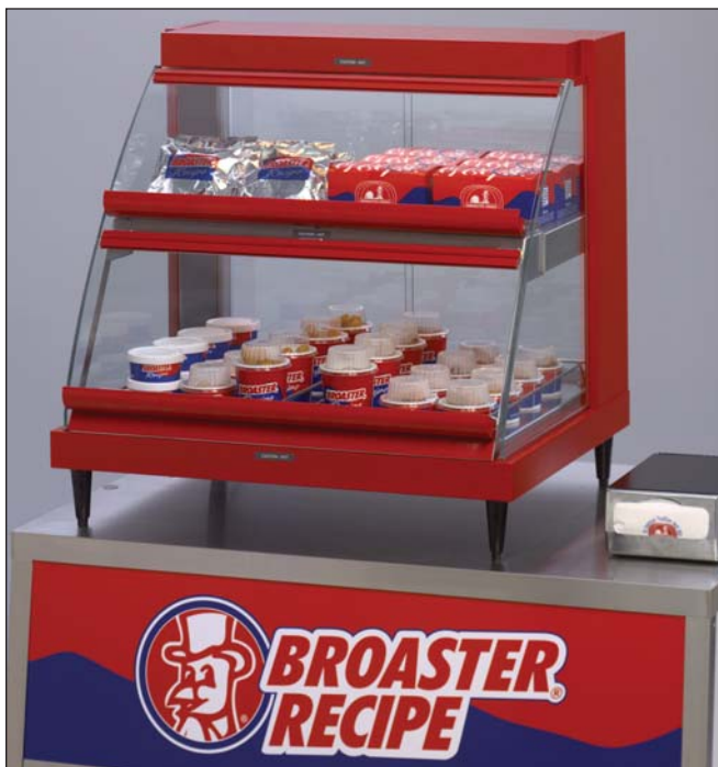
GRCD-2PD with optional red designer color and flip-up doors.