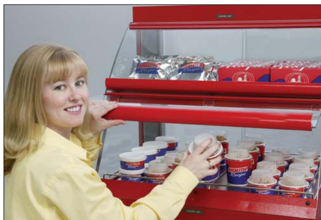
GRCD-2PD with optional red designer color and flip-up doors.